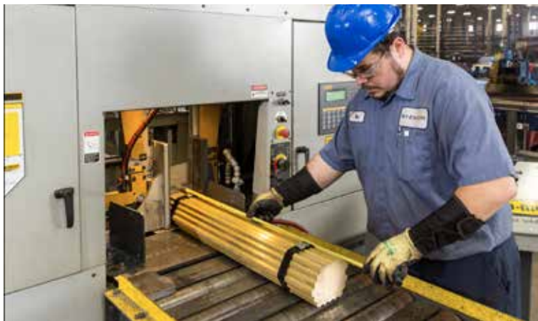
A Ryerson employee measures a product coming out of one of its processing machines.

“We are pleased that the port was able to provide a site that could meet GVH’s needs and bring these much-needed jobs and tax base to our community. This project will create an excellent addition to Park 1, and we look forward to a long relation-