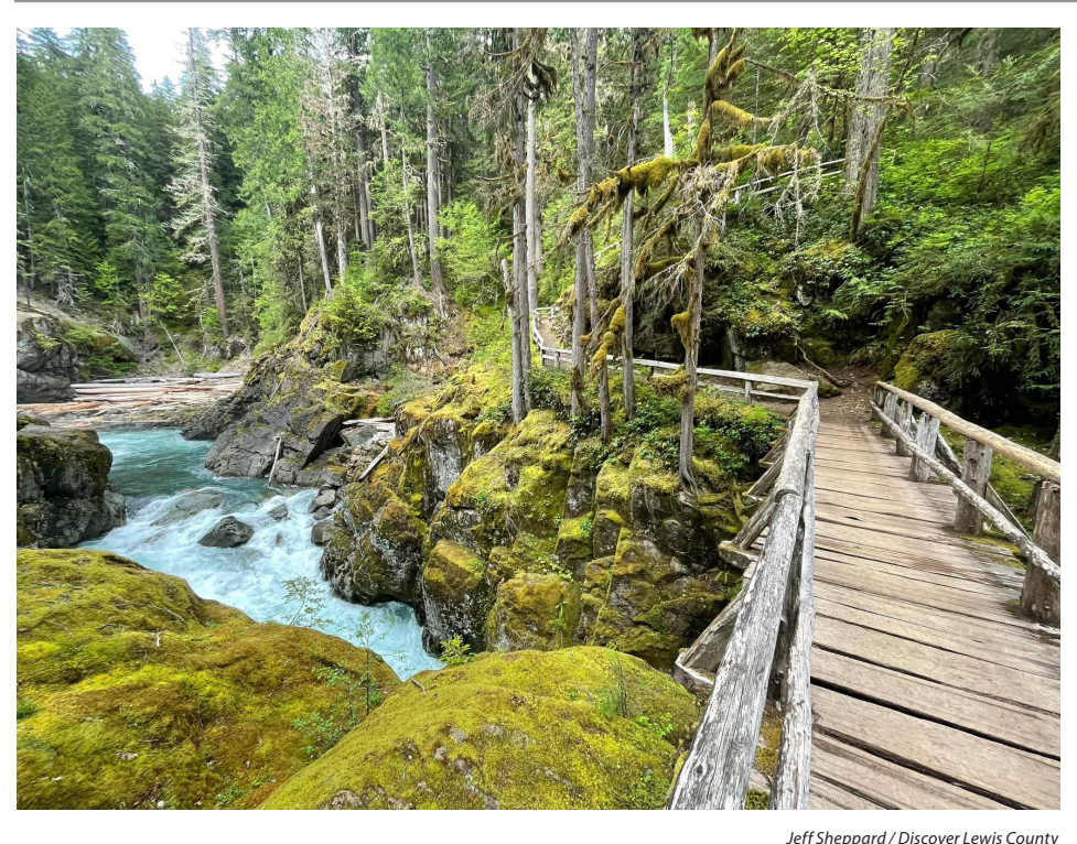
You can hike up to Silver Falls, a short, sweet little loop in the southeast corner of Mount Rainier Na-