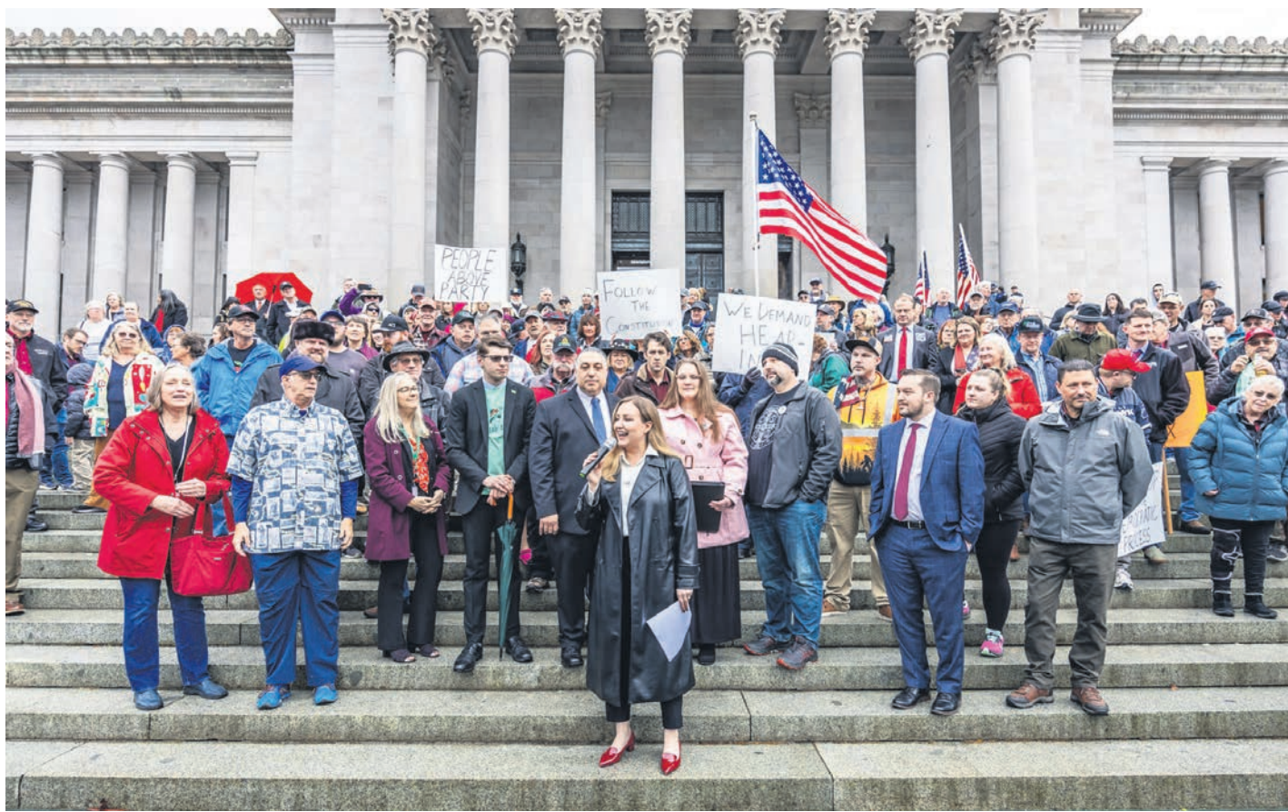
BRANDI KRUSE COURTESY PHOTO